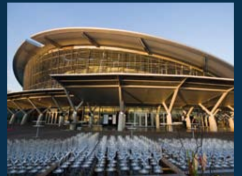
The Darwin Convention Centre