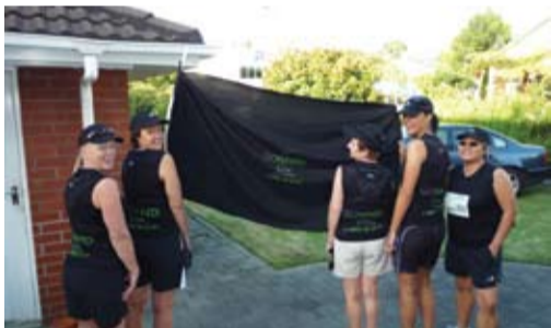
The reverse of the T-Shirts displaying the GoNaked slogan