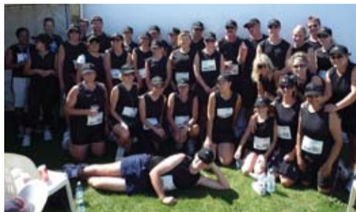
Some of the Eye Institute Team